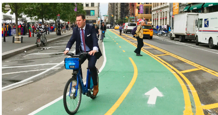
Cycling through the Square is now safer + easier with new, improved bike lanes.

Avenue, and extended around the Square with new lanes on Union Square East, East 15th, 16th and 17th streets. Given the area's popular Citi Bike docks and the district's 6,500 daily bicyclists, these enhancements ensure the safety of the increasing amount of commuters who cycle through the Square. According to DOT, NYC has experienced a 68% increase in daily bike commutes [between 2010 to 2014] and a 23% increase in daily Citi Bike usage from 2014 to 2015. With Union Square's central location, the network's expansion improves one of the city's busiest and most popular destinations, making the area safer, more accessible and inviting for residents and visitors.