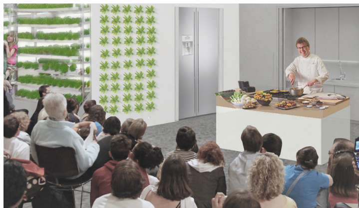
GrowNYC's new education center and event space opening at 76 East 13th Street.

to promote the neighborhood's longstanding tradition of providing access to healthy foods, education, and the arts.