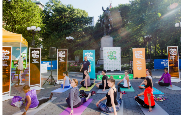
USP's free community programming draws larger crowds every year.

In its 40th year, USP's free community entertainment series, Summer in the Square , continues to promote the business sector that has transformed the area into an epicenter of health, wellness, culture, and technology. And with less than a month to go, this summer's series is on track to draw tens of thousands of visitors to the neighborhood, encouraging exploration of the district's thriving retail and restaurant scene. To further increase this year's attendance rates, USP expanded the series' most popular programming, children's activities, and movie nights, and packed the roster with more than 120 events from 25 community partners. From morning and evening fitness classes to children's activities and live music and dance performances, each week highlights the neighborhood's economic breadth and diversity. Interested in promoting your brand to the Union Square community? Contact us to partner and gain exposure for your business.