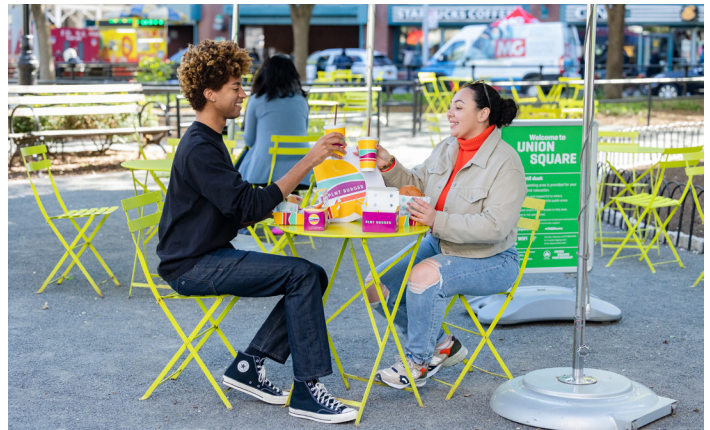
USP's upgraded seating area in Triangle Park introduces the ideal spot for take-out: With its central location at the meeting point of 14th Street, Fourth Avenue, Broadway, and Union Square East, there is a robust selection of quick-service eateries just steps away.

Union Square-14th Street is home to 204 active storefronts, including over 70 food + drink options, healthcare + academic institutions, a variety of retail, and so much more.