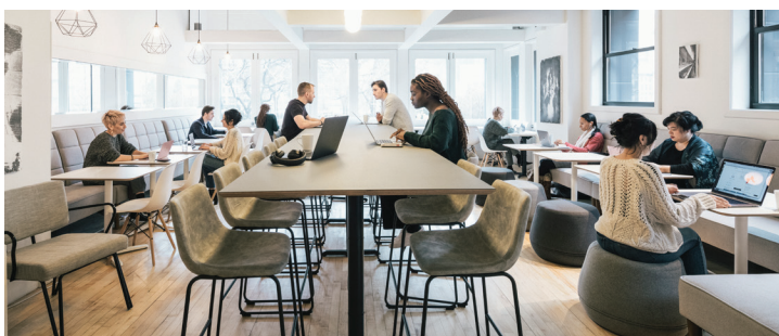
Spacious transformed the former TGI Friday’s into a new co-working space at 34 USQ East.

Union Square continues to attract new, first-of-their-kind retail and culinary concepts. This winter Union Square was dubbed the unofficial “chocolate district” of Manhattan with recent openings of new chocolate purveyors – Milk Bar at the Camp Store, Blue Stripes Cacao Shop, Venchi, and the Nutella Cafe, which is the brand’s first standalone restaurant in New York City. Businesses catering to the neighborhood’s many families are also popping up. Last quarter, CAMP and Union Square Play opened their doors – one offering an interactive shopping experience for families and the other a new respite for children to play.