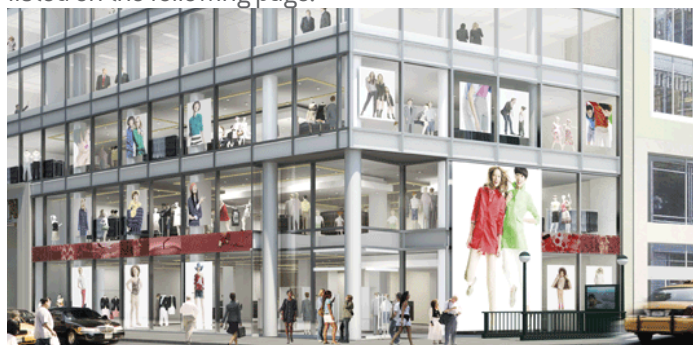
853 Broadway - Courtesy of The Feil Organization

and Fifth Avenue. The space combines an existing Duane Reade with two adjacent storefronts. These opportunities and more are listed on the following page.