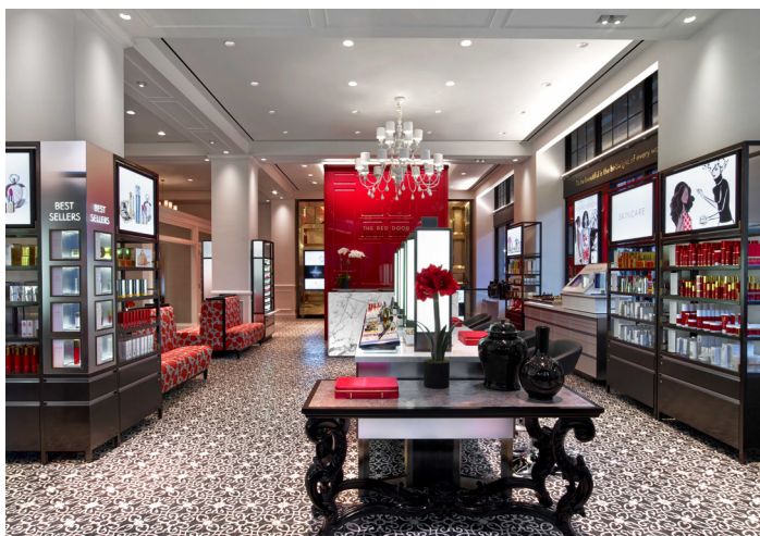
The Red Door, Union Square

Union Square is getting stronger and even more beautiful in 2014 with the opening of two New York health and beauty destinations. This spring, Reebok is set to open a FitHub on the corner of 14th Street and Union Square West. The new fitness mecca will be the largest of the brand's stores in New York City and will include a 4,800 sf apparel shop and 6,800 sf CrossFit gym. Reebok's move to Union Square coincides with beauty heavyweight Elizabeth Arden's new spa The Red Door, now open on the corner of East 17th Street and Park Avenue South. The Red Door features both traditional and speed spa services, targeted to the professional, trend-setting New Yorker. "Union Square is a quintessential New York neighborhood, with a historic park, concentration of young professionals, and hip vibe," said Meredith Smith, Senior Director, Global Marketing, Elizabeth Arden New York. It is no surprise that both companies chose to open their new concepts in Union Square.