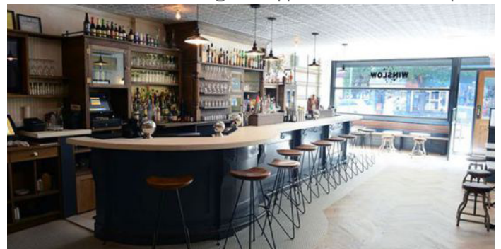
The Winslow, 243 East 14th Street

excitement is all about. Get in on the action and view the map on the back for the remaining retail opportunities in Union Square.