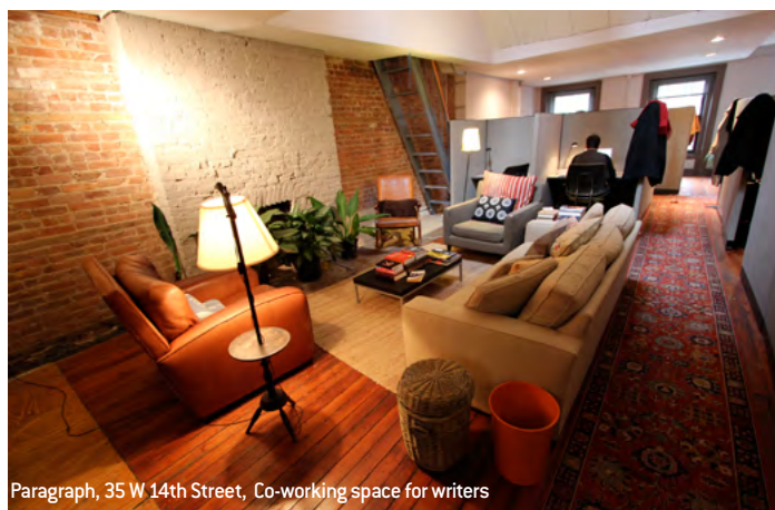
Paragraph, 35 W 14th Street, Co-working space for writers

Co-working is not just for aspiring techies –writers looking to get out of the coffee shop and into a professional and collaborative setting in Union Square can join Paragraph on 14th Street. Started by two New School MFA grads, Paragraph is a membership-based work space providing an affordable and quiet environment for writers of all genres. If you're looking for a free, casual drop-in work spot, stop by Wix Lounge on 18th Street. Application based accelerators and incubators such as Nest, Inkg Labs and General Assembly are also in the neighborhood and offer a variety of start-up businesses with alternative work spaces in the competitive NYC real estate market.